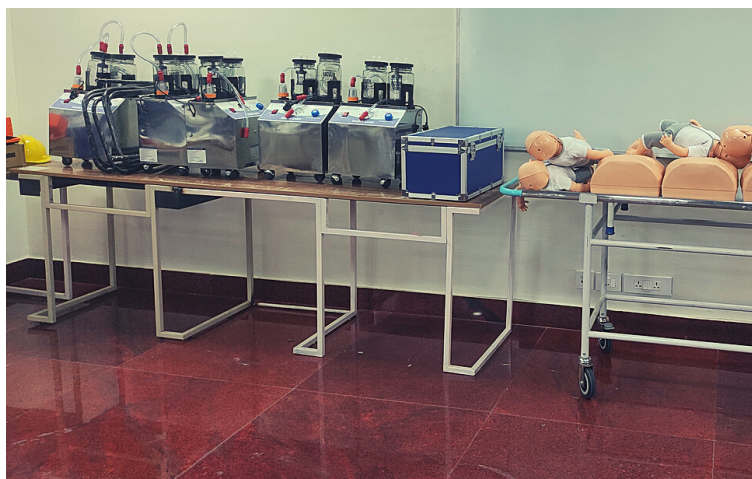
Well-equipped Laboratory 1