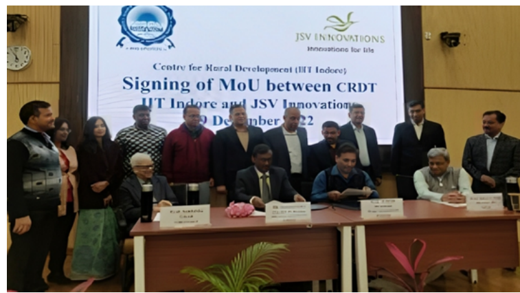
MOU Signing with JSV at IIT Indore