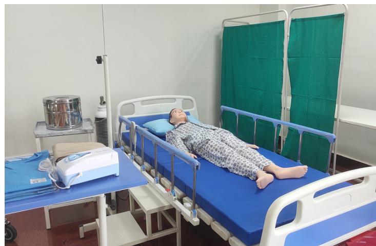
Well-equipped Laboratory 2