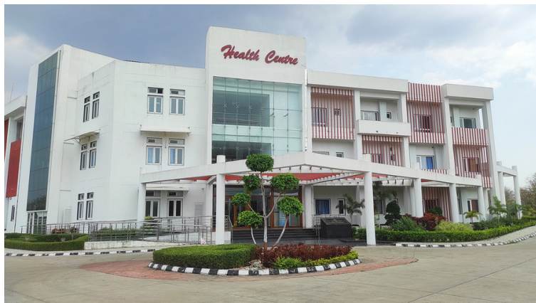
Health Centre, IIT Indore