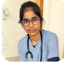
Patient Care Assistant Tata Medical Centre, Kolkata

Born & brought up in the hills of Kalimpong, she is now employed in Bangalore,. She now draws a monthly salary of Rs 19,000/-