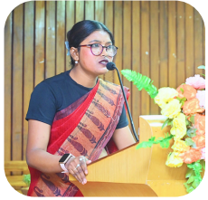
Project Lab Technician ICMR-NIN Project