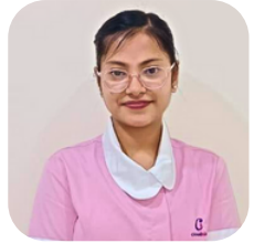
General Duty Assistant Cloud Nine Hospital, Bangalore

From a remote village in Birbhum, he has secured employment as OT Assistant with a monthly salary of Rs. 18,000/-