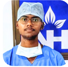
OT Assistant NH Multispeciality Hospital, Barasat

Overcoming the financial constraints, she is now working under the project of ICMR, withdrawing a monthly salary of Rs. 18,000/-